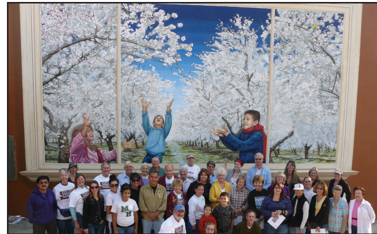
"Manteca Snow" is one of 32 murals in Manteca!